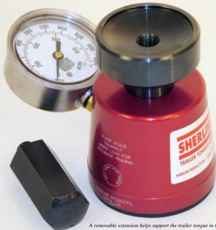
A removable extension helps support the trailer tongue in the trailer ball socket. With the extension removed, the piston has a depression in the top to help center the wheel or bottom of the trailer jack stand.

(NOTE: Not legal for trade; i.e., items sold by weight.)