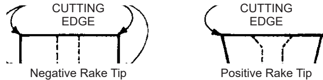
FIGURE 1—Negative and positive rake carbide cutting tips. Negative rake tips can be held upside down giving four cutting edges. Positive rake tips cut from one side only, but cut better.

to be sharpened at the time of manufacture which adds to their cost, but also adds to their performance on a Sherline machine. You can't use any insert in these holders unless it has a positive cutting edge.