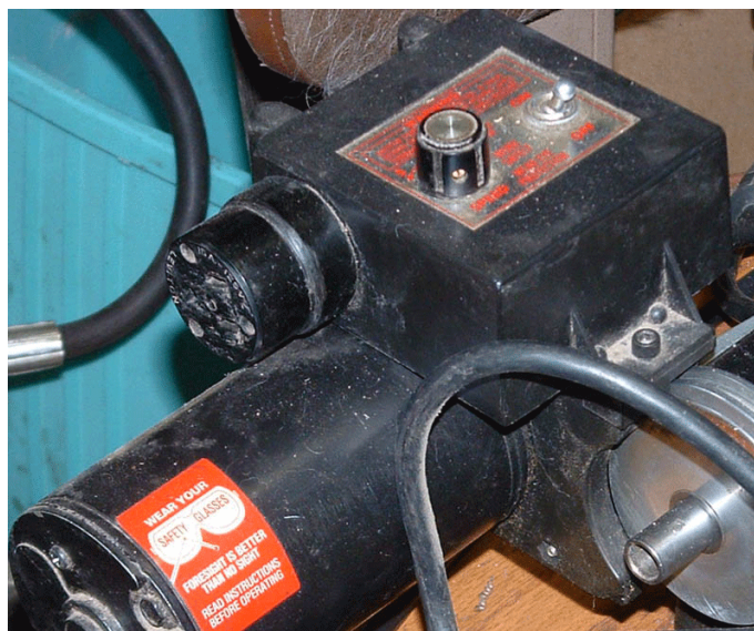
Photo 2—Shows the female plug he added to the speed control housing so that when power to the motor is switched off, power to the power feed is cut at the same time. The power cord is not plugged in for this photo to show the connector more clearly.