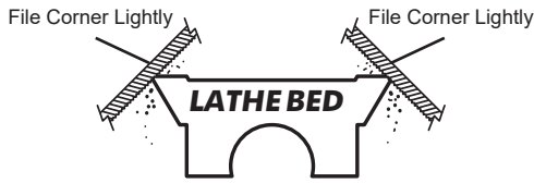
FIGURE 1—Filing corners of bed dovetail for better fit of tailstock riser block.

screw pick up the same indentation so you don't "chew up" the end of the leadscrew shaft.