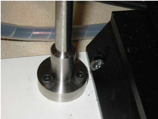
Photo 4: A closeup of the base shows the stainless steel mount that is attached to the board. Spiked T-nuts are mounted to the bottom of the board to accept the 8-32 countersunk screws.