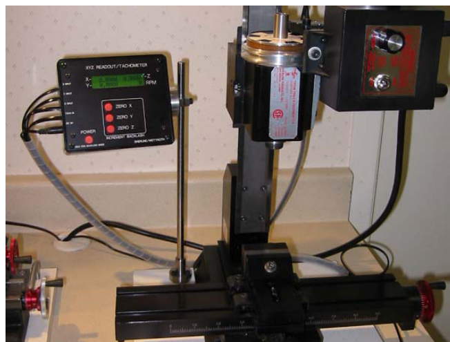
Photo 2: An overall view of the mill shows the neat use of spiral plastic wire bundling material to control the clutter of wires from the box to the individual axes and the RPM sensor.