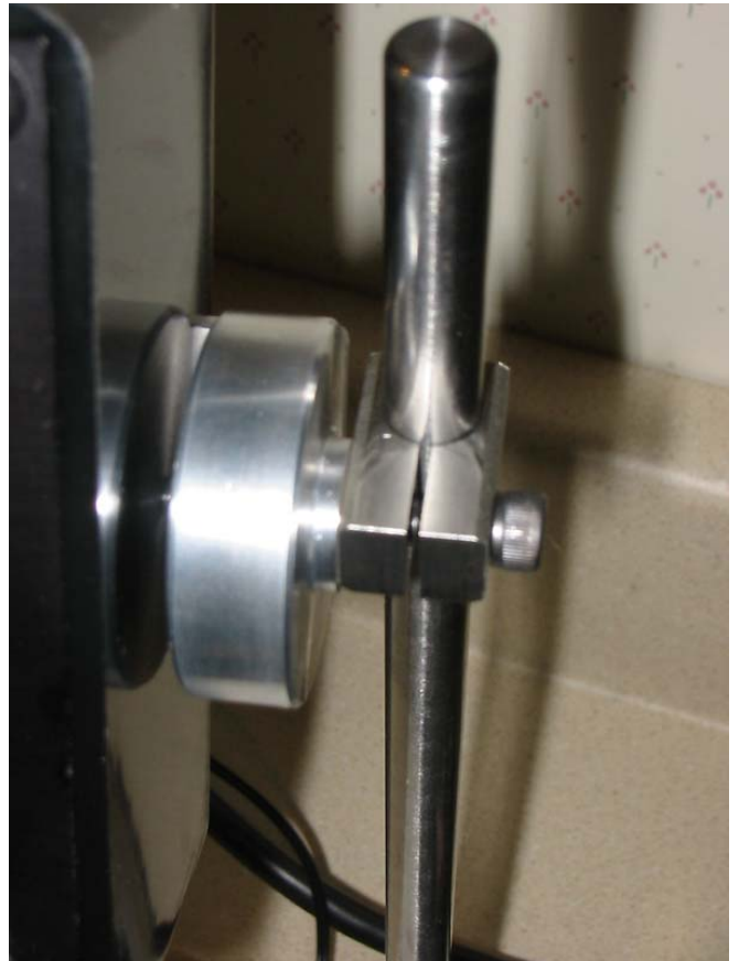
Photo 6: A top view of the adjustment system shows the slit in the piece that slides on the shaft. The vertical shaft is 12" long because Ron has a 15" tall Z-axis on his mill in place of the standard 11" column. For normal height mills the rod could be shorter than 12".