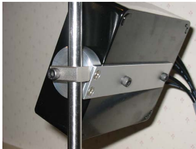
Photo 1: Side view of the adjustment mechanism shows the flat stock pieces. The mounting plate for the two attachment screws is fixed inside the box using double-sided tape to keep it in place and it is tapped to accept the mounting screws. The rectangular part is slit, allowing the single adjustment screw to control both rotation of the box and position of the bracket on the rod.

Ron goes on to say, "The flatstock portion of the bracket for the DRO is 1" aluminum, with a corresponding 1" tapped aluminum flatstock piece fixed with mounting tape to the inside of the DRO case. This allows for easy removal of the bracket. The round portion is 1.5" aluminum, about 0.5" thick with a 0.1" nipple to stand off the adjustable link. The adjustable link is 303 stainless steel with a 0.050 slit. Obviously, materials used can vary, although I would recommend aluminum for the bracket itself just to keep down the hanging weight. I used the 303 because I happen to like it (even though I seem to have some allergic skin reaction to the nickel content) and I had the right sizes in my scrap bin. Actual dimensions are not critical in most cases and construction is obvious from the photos. The socket screws are 10-32, which is the same as most other adjusting screws on Sherline machines, so the same hex key will be readily available when adjusting the position of the DRO. The flathead screws are 8-32."