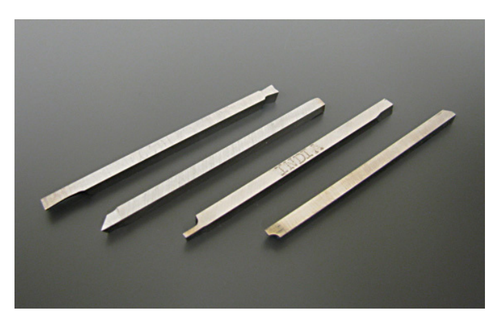
Photo 3—Above is a photo of several 1/8" tool bits that I have ground.