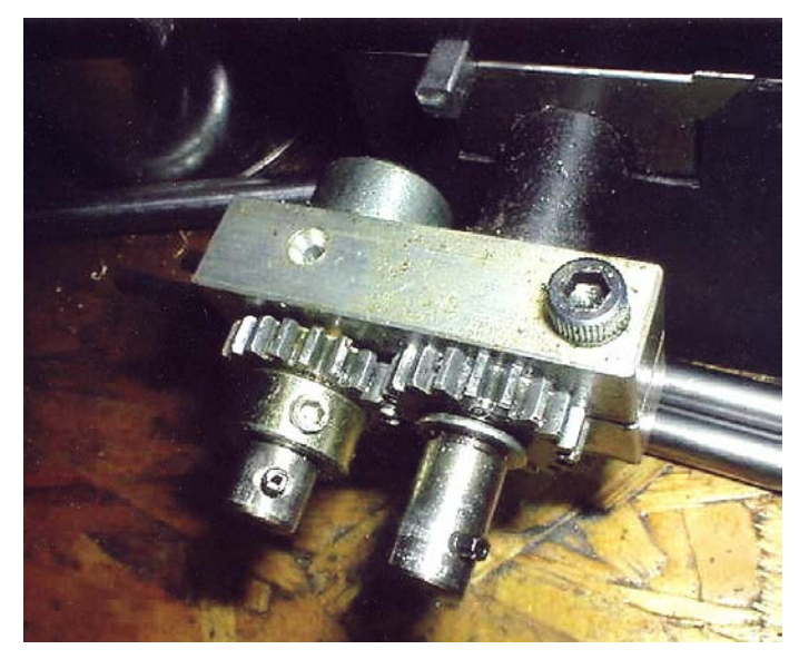
By powering the countershaft on the left the carriage is driven in the reverse direction. The main shaft on the right is extended to drive it in the standard direction. The power feed motor unit is not fastened down and can be moved to either shaft end depending on the direction desired. A store-purchased 3/8" collar with set screw fits on either end of the countershaft to hold the second gear in place and locate the shaft.

The P/N 3001/3011 power feed is not used in the usual sense you think of a power feed on a big production lathe; that is, to save the labor of turning the leadscrew handwheel when doing a large job. In most cases on a lathe as small as a Sherline physical labor is simply not a factor. Instead, this power feed is intended to be used to put a perfectly consistent finish on the last pass of a part on the lathe. It runs at a single speed of .9"/min and only in one direction. For those who want to use the power feed to return the carriage to its original position, William Geissinger has come up with a way to install a reverse gear setup. He uses two 20-tooth gears from Sherline's thread cutting attachment and some simple parts he made himself. His description follows.