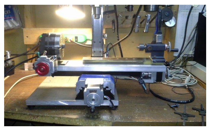
Figure 1— Rotary Milling Fixture installed on 5400 mill

First of all, I'm just a "hobby machinist" or worse, but I've always been fascinated with "making" things. From the first time I saw a Sherline (Craftsman at that time) lathe, I knew I had to have one. That was 1986. Since then I've upgraded and modified my Sherline lathe and mill many times, the latest being to CNC the mill and starting on the lathe. The base for this fixture is similar to a tooling plate, only longer and thicker than most, as you can see from the file indicating dimensions (See Figure 4).