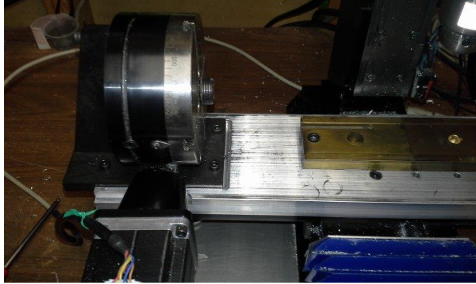
Figure 2—CNC rotary table with vertical mount

I started this milling project as a result of discovering that the material I wanted to work on was too long to fit between the rotary table on vertical mount and the offset tailstock, yet I had 8" of X-axis movement. I was sure there was a way to get more work handling capacity. The original project that inspired this fixture was a custom muzzle brake, but any part that can be held between the rotary table and the tailstock of this fixture can then be machined in multiple dimensions, similar to a CNC trunnion, except that this fixture allows for 360 degree rotation and machining.