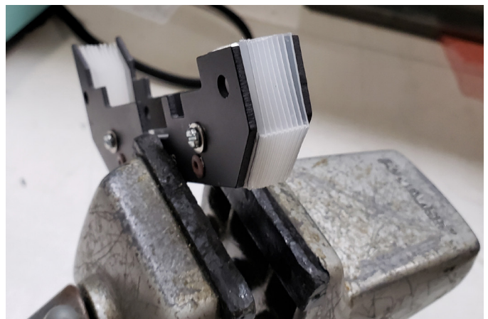
FIGURE 4—This image shows the altered plastic cover.

NOTE: This step applies only to way covers on standard leadscrew mills.