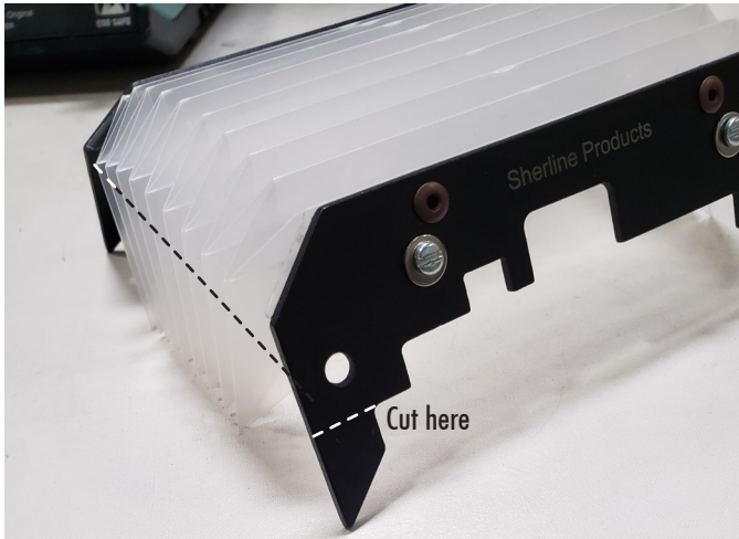
FIGURE 1—Front view.