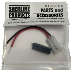
FIGURE 2—An example of a probe connector assembly that we send with each MASSO Touch controller on our Accu-Pro machines.